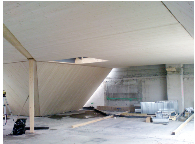
Interior view throat