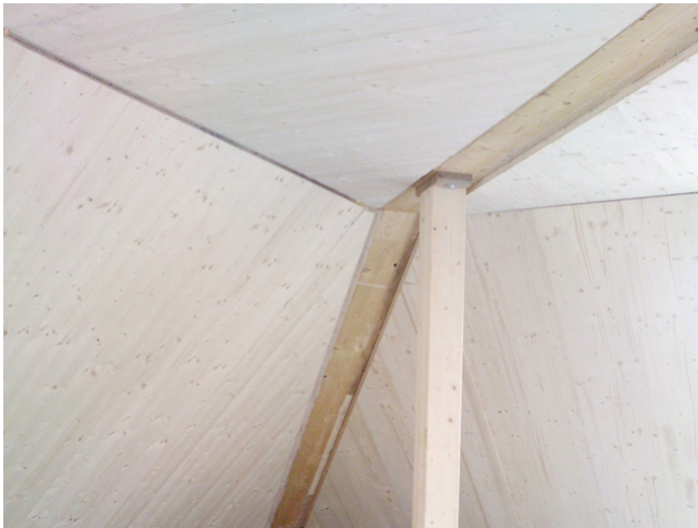
Interior view ridge