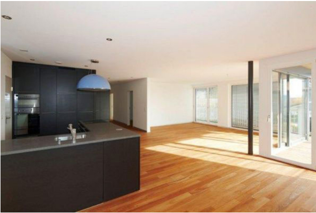
Interior view south apartments