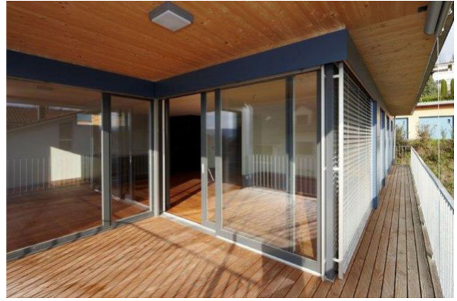
Exterior view south apartments