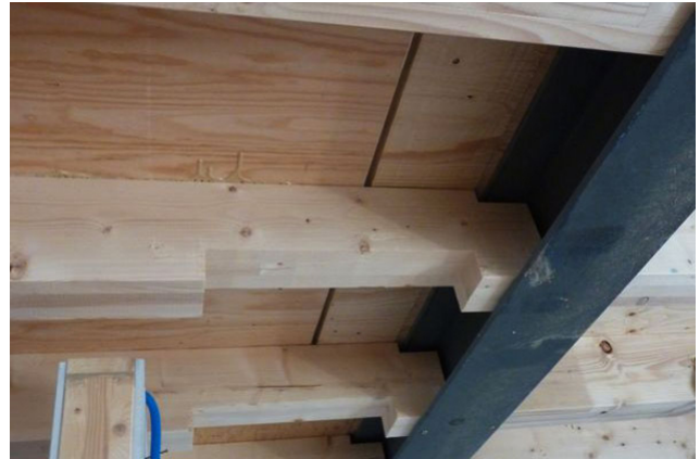
Cutouts for building services installations in the rib elements of the floor slabs