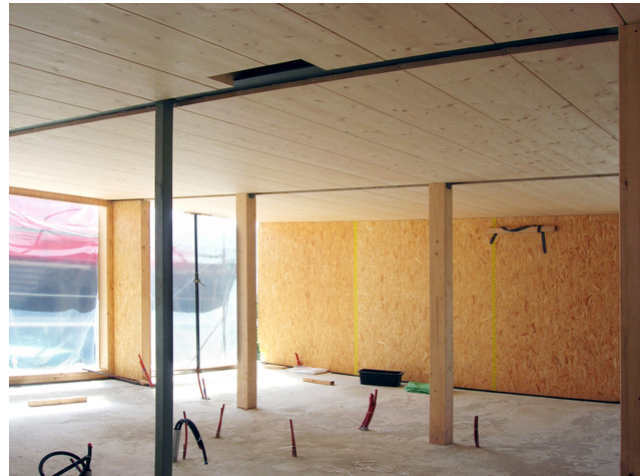
Supports in wood