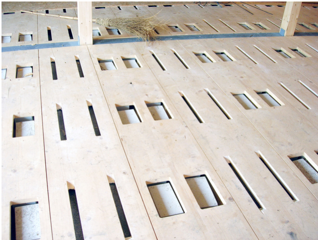
Filling the opening signature silence