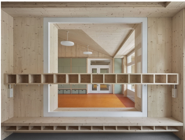
Wood as a leading element of interior design