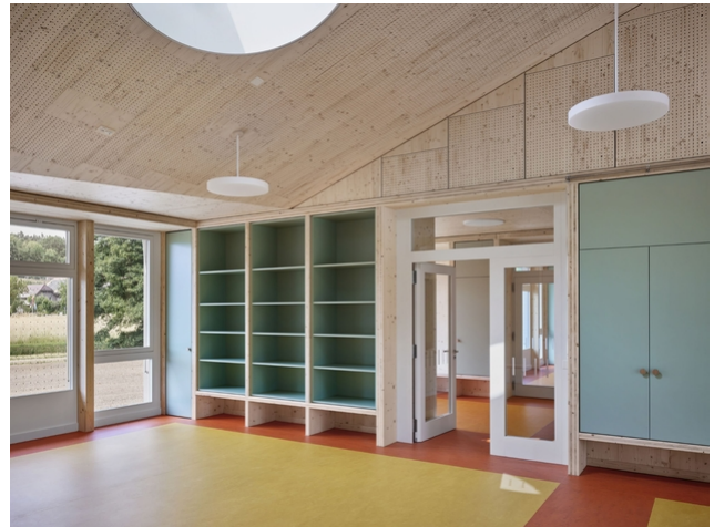
Harmonious color and materialization concepts in the interior