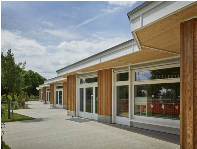
Exterior view after completion