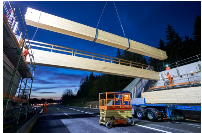
...and are placed in one piece on the concrete foundations.