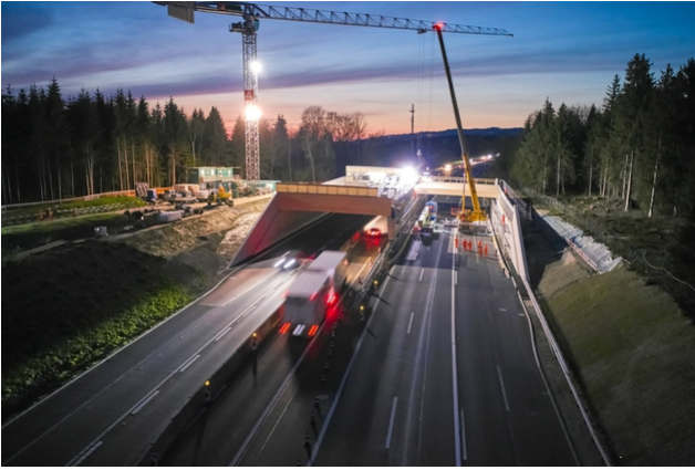
Assembly work with single lane traffic