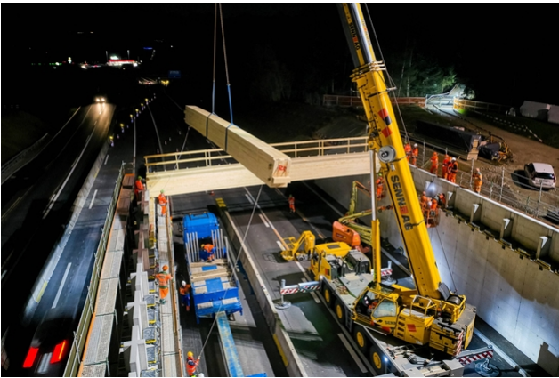
The girders weigh about eight tons...