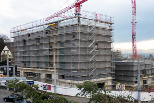
Apartment house with construction site scaffolding