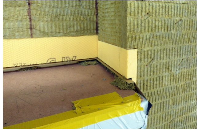
Detail insulation on window sill